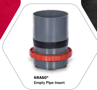
KRASO® Empty Pipe Insert