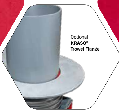
Optional KRASO® Trowel Flange