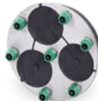
3 x 6 - 52 mm or blind