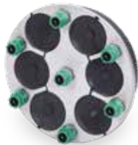
6 x 6 - 38 mm or blind