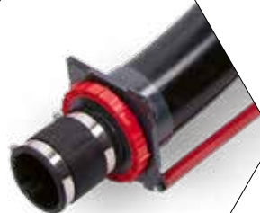
Hose adapter DN 110