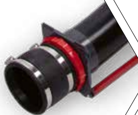
Hose adapter DN 160