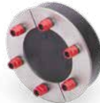
1 x 50 - 92 mm or blind