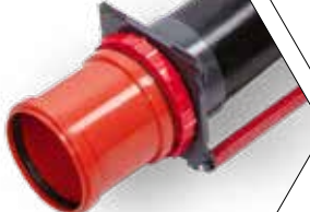
Sleeve DN 160