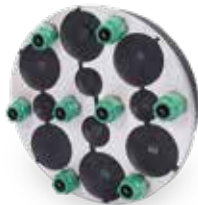
4 x 6 - 18 mm and 6 x 6 - 33 mm or blind