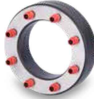
KRASO® Type DD