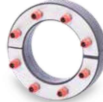
KRASO® Type DD/T (split design for retrofit installation)