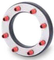
KRASO® Type ED

KRASO® Sealing Insert Type ED + DD + VD Check the installation video (just scan the QR code!)