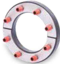
KRASO® Type ED/T (split design for retrofit installation)