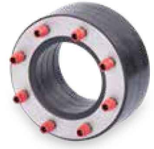
KRASO® Type VD